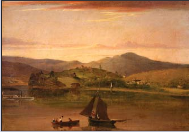
Steamer R.W. Sherman, unsigned painting ca. 1860-1870.

The North Star Underground Railroad Museum reveals the hidden history of the Champlain Line of the Underground Railroad. Poignant exhibits portray compelling stories of fugitives from slavery who passed through Northeastern New York and the Champlain Valley on their way to Quebec and Ontario, Canada.